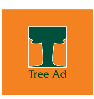
Exclusive Media Representative